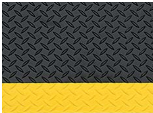
Black w/Yellow Border