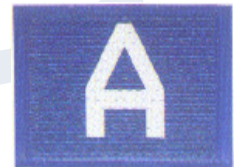
Block Letter Style